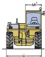
(1) Internal width